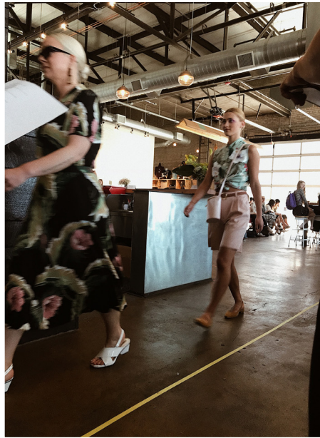
Moth Oddities , similarly to Arc's Value Village's collection, embraced a pastel yet bright palette. It's definitely Spring; hand me those lilac trousers please.