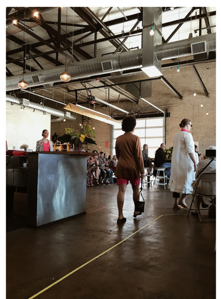
The Keep wonderfully snuck in the color of 2018-- millennial pink. This color is hardly, if ever, seen in my wardrobe but The Keep really incorporated this color so well into their looks. I'd never thought I'd enjoy a tan blazer with millennial pink shorts. I am changed.