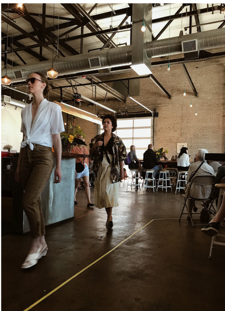
Arlee Park showed a modern take on vintage which was really inspiring and the most accurate to my personal style. I also call them the "Denim Gods" as you'll see later; they have the sickest denim. If I could, I would sweep away that second look all to myself.