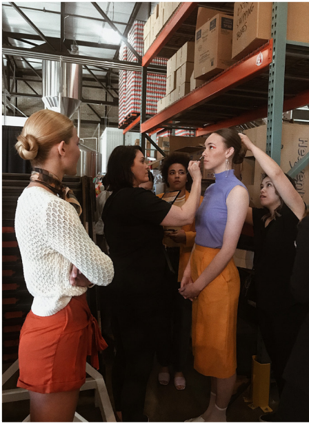
Arc's Value Village incorporated vibrant, bold, yet soft colors into their looks. An upscale and modest vibe with a hint of fun, along with the help from a stripe of eyeshadow.