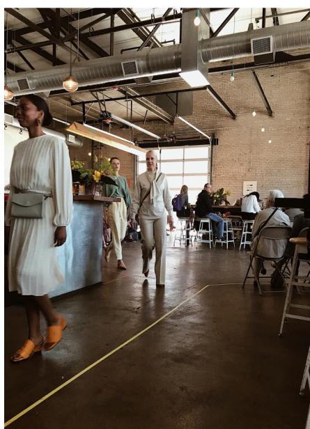
I really enjoyed Golden Pearl Vintage's looks. I don't think I'll ever not be obsessed with an all white outfit. It makes someone an instant angel. Also, this season we buckle our mini purses around our waist, just like how I will be doing with my new thrifted Prada bag (that was a great day). But anyway, dope, dope looks, Golden Pearl Vintage, my eyes thank you.