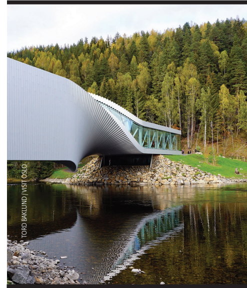
TORD BAKLUND / VIST OSLO